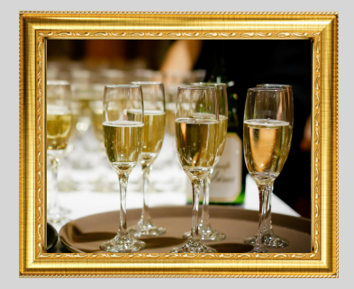
Bar None Host our bar during the Gala celebration as guests mingle and celebrate!