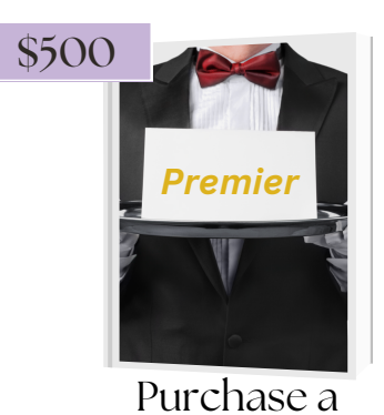
Premier Ticket One Gala Ticket Mission donation of $350 Invitation to VIP Reception Name in Program