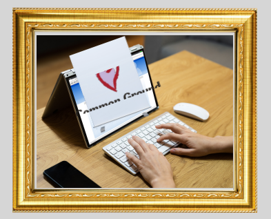
Let's Celebrate! Display your logo at the highly visible Gala registration table