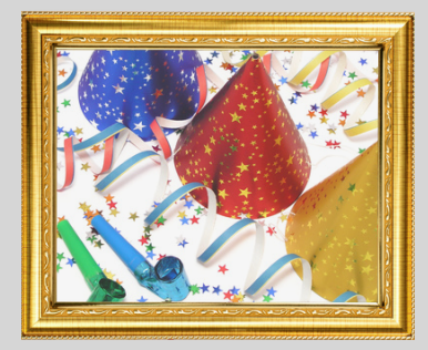
Cheering Section Sponsor the cheering section and noisemakers for guests to use throught the event.