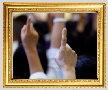
Double Dollars Match every dollar raised during a designated time - up to a certain amount - doubling funds raised for Common Ground!