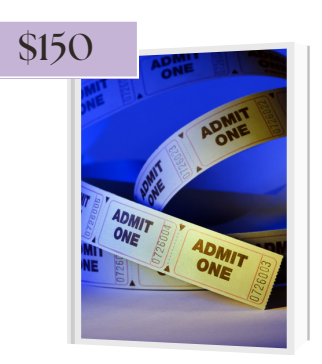
Cost of General Admission Ticket