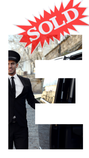
Valet Service Sponsor