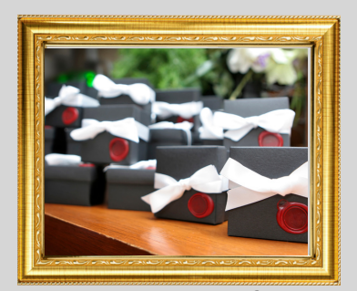
Parting Gifts Provide your branded dessert or favor given to guests as they depart.