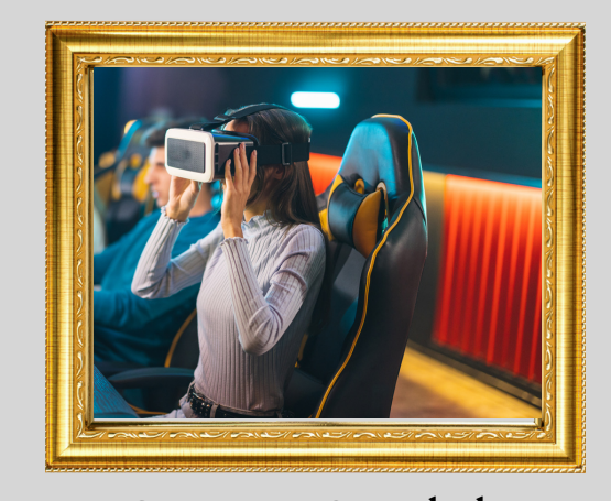
Surprise & Delight Bring the WOW factor to the Celebration with an interactive or display station unique to your company.