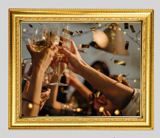
Toast to Tonight Share a message and raise a glass in honor of the supporters and celebration guests.