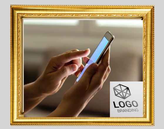
Technology Titan Include your branding on our event auction and donation sites at both the Celebration of Hope Gala and Birmingham Street Art Fair in September.

Or choose any activation from the Platinum or Gold Sponsor levels!